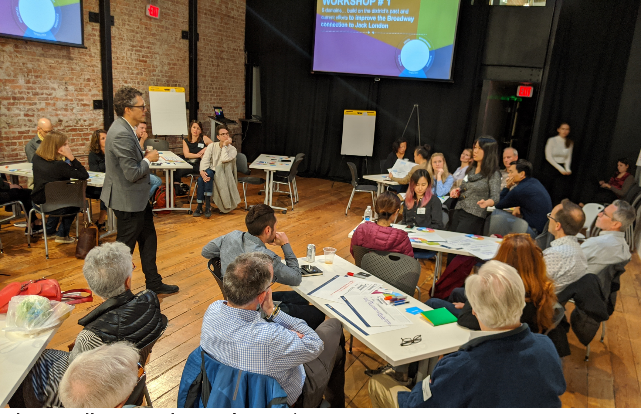
The Walk To Jack London 2/10

Community Wellness Framework- w/SPUR, DIALOG