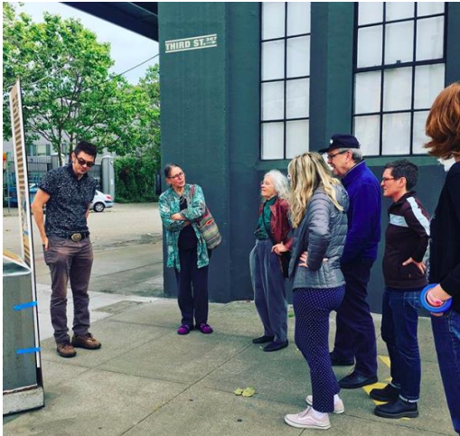
Volunteers and Oakland experts check out the Historic Waterfront Warehouse District Interpretive Signage mock-ups

More public right-of-way beautification is on its way.