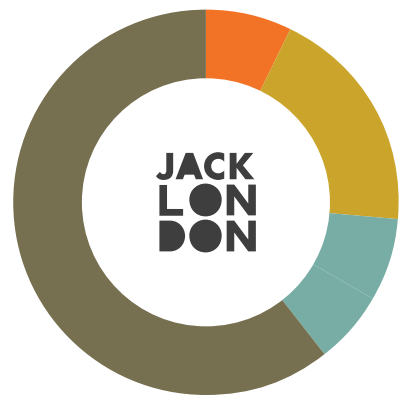
2020 Budget Breakdown Cost of Providing Improvement Activities

Annually, the Improvement District's budget is balanced.