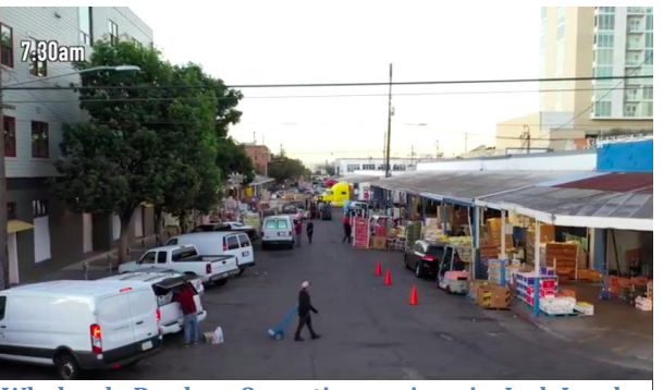
Wholesale Produce Operations unique in Jack London

Downtown Oakland Specific Plan final draft is here, and we're collaborating with our neighboring businesses and stakeholders to