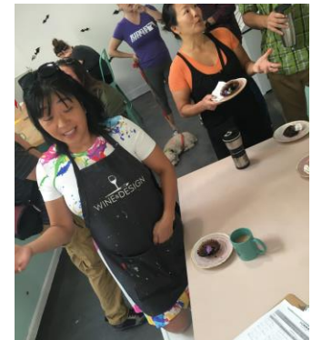
Business Coffee hosted at James and the Giant Cupcake

have noted an uptick in customers' bad practices tossing old produce and cartons, negatively impacting adjacent businesses, property owners, and passers by. We see this as an opportunity to bring together the relevant department and agencies to help us support and enforce cleaner operations for everyone's benefit.