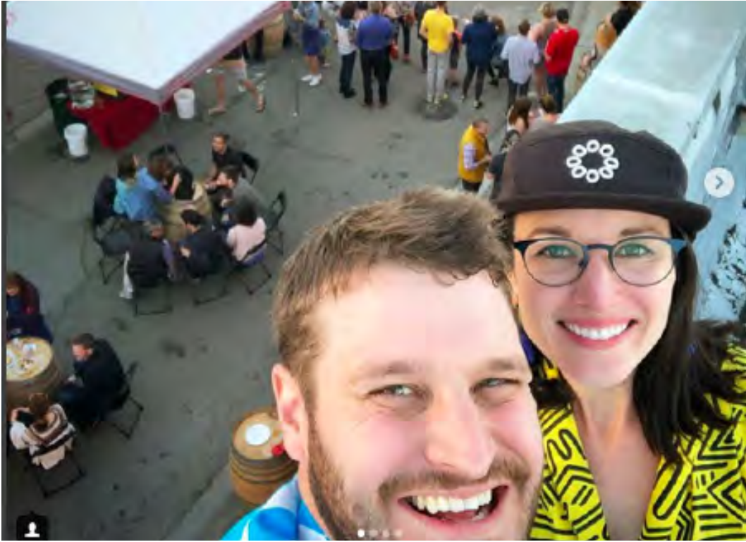
Events/Campaigns Promoting Local Businesses