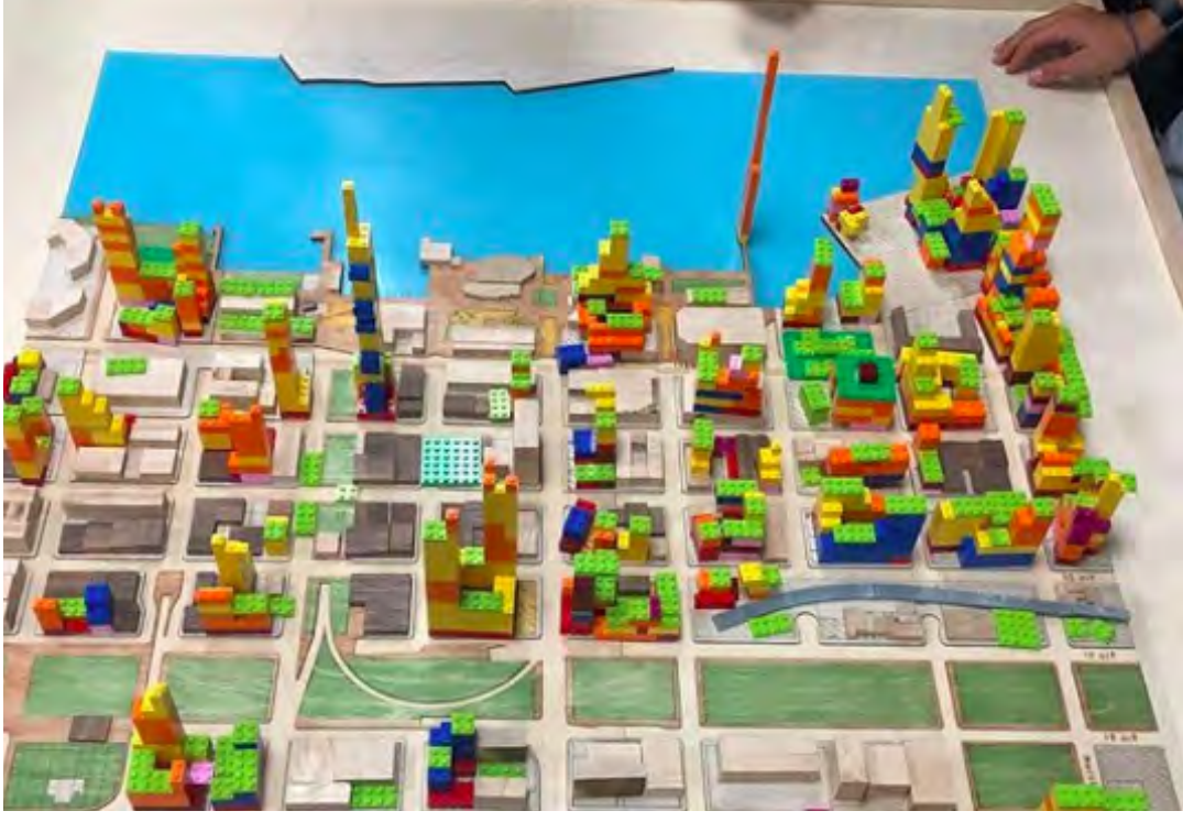
Quarterly Panel Talks