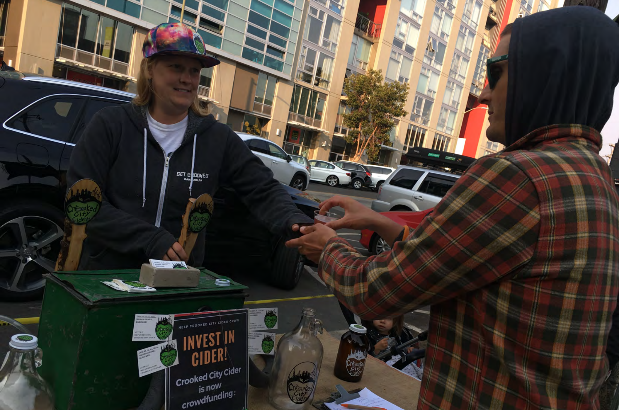
National Night Out